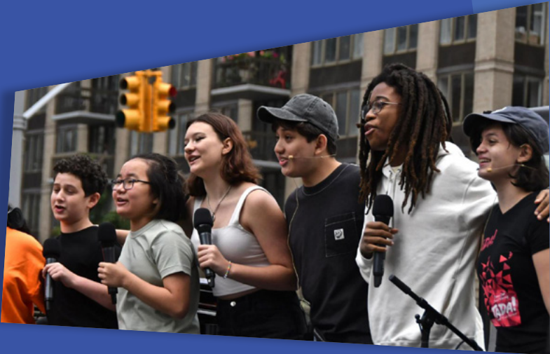
RYET Members participating in Tin Pan Alley Day.

Lessons in voice, acting and dance as well as audition preparation for middle and high school students were offered to RYET members