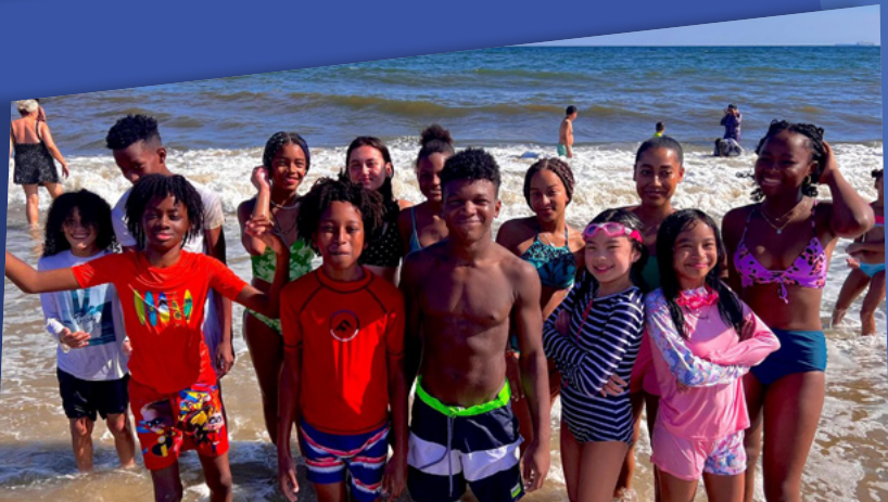
RYET's end of the year excursion