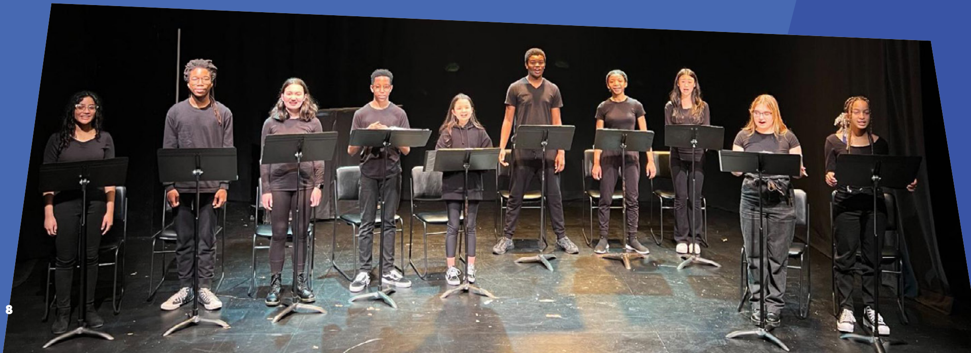
Cast members of our New Works Workshop of Common Ground

Work continued on this new piece created by RYET members and Alumni in 2017, with topics including street harassment, dating, body image and fighting stereotypes and oppression. The show is scheduled for its World Premiere production in FY24.