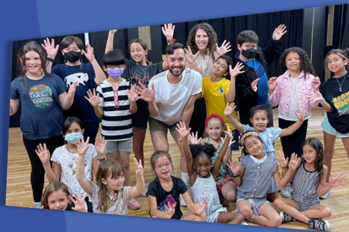
Teaching artist with students of an onsite Education class.

At TADA! we believe that no child should be turned away because of their inability to pay. This fiscal year, we were thrilled to continue our Arts For All (AFA) Financial Assistance program, providing students who demonstrate self-expressed need and identify as BIPOC full-tuition sponsorships to attend our acclaimed musical theater onsite and online education programs. We are happy to announce that we provided 49 students with an Arts for All full-tuition sponsorship.