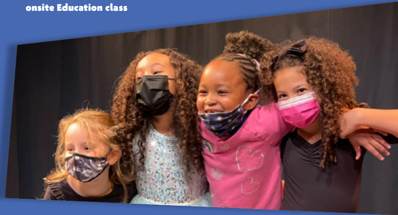
Students from an onsite Education class

At TADA! we believe that no child should be turned away because of their inability to pay. This fiscal year, we were thrilled to continue our Arts For All (AFA) Financial Assistance program, providing students who demonstrate self-expressed need and identify as BIPOC full-tuition sponsorships to attend our acclaimed musical theater onsite and online education programs. We are happy to announce that we provided 49 students with an Arts for All full-tuition sponsorship.