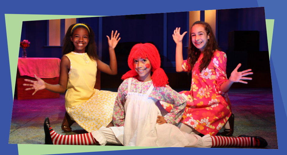
The Little House of Cookies

Past TADA! original productions (The Perfect Monster, B.O.T.C.H, Princess Phooey, The Little House of Cookies, The Little Moon Theater, and The Gift of Winter) were provided for free on YouTube and were seen by almost 1,500 households.